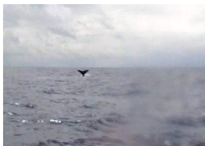
Tail fluke of one of the Sperm Whales

Jude Brice (senior skipper) was alerted to the presence of the whales when he saw a foamy spout coming out of the water in the distance. After alerting the other staff members on board, he diverted the boat to the location of the sighting and identified it as a Sperm Whale, which is a rare sighting for Aldabra! Only six previous sightings of these whales have been recorded, the first record in 1980 and the most recent sighting in 2003.