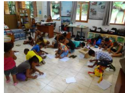
Kids playing games at the visitor centre

International Day of Biodiversity is a global event celebrated every year on the 22 nd May to raise awareness of biodiversity issues and celebrate global biodiversity. To commemorate this important day SIF organised various activities at the Vallée de Mai on the 24 th May.