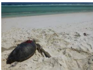
Alda' on her way back to the sea

Once both females had completed covering their nests, they were contained within a box to allow attachment of the satellite tag. Following some initial discomfort as they could not return immediately to the sea they both fell asleep in the box! The research team prepared the top of the shell for the satellite tag by cleaning and sanding it to enable the glue to stick properly. They then applied several layers of special glue and fibreglass to create a strong bond which should ensure the tag stays secure for a long period of time, and finally applying antifouling paint to prevent algal growth. The female turtles were then released, bid good luck and farewell and with lots of crossed fingers the team waited to see if they received messages from the satellite tags. To everyone's joy and excitement we have since received location points from both females. Alda departed Aldabra immediately and the other female has so far remained close to the west coast of the atoll.