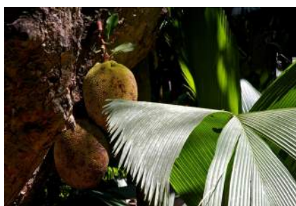
Jackfruit tree in the Vallée de Mai

The Praslin invasive species team has continued to tackle invasive alien trees in the Vallée de Mai this month as part of the management action for the site. After the completed control of Albizia ( Falcataria moluccana ) the focus has now moved towards control of Jackfruit ( Artocarpus heterophyllus ), Santol ( Sandoricum koetjape ) and Bwa Zonn ( Alstonia macrophylla ). These species were introduced to Seychelles from Asia in the 20 th century for food and timber. The fruits of Jackfruit and Santol trees are commonly eaten in Seychelles, but the species pose a threat to the endemic flora of the Vallée de Mai. All three plants are considered to be invasive in other locations of the world as they outcompete native and endemic plant species. Santol can create a dense canopy cover, restricting light to native plants below. Both Santol and Jackfruit can potentially create 'toxicity' in the soil, also preventing the natural growth of the native palms. Bwa Zonn has been listed as one of the most problematic invasive trees