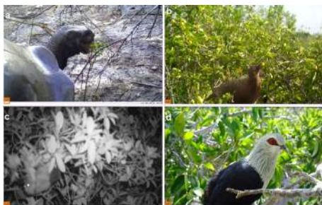
Some stills from the camera trap footage