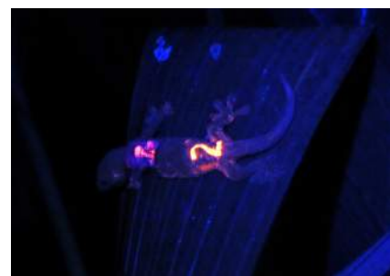
'Trachy' number 2 by night under UV light

All geckos caught are measured and implanted with a small PIT tag which can be read by an electronic device when the animal is re-caught and identifies it for life (like a barcode). The geckos are marked with a temporary but highly visible UV-florescent number, lasting only until the animal next sloughs its skin. A few lucky animals are also fitted with a tiny 1.5g radio-transmitter in a custom-designed back-pack which happens to be red and resembles a mini superman-style cape (see photo). The transmitters are ideal because they allow the animal to be tracked directly and not depend on opportunistic re-sightings or recaptures to obtain information on their movements. Finally, all of the geckos are then released where they were caught.