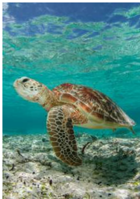
Green Turtle

After several months of intensively monitoring the nesting turtles on Settlement Beach, Picard the Aldabra research team attached satellite tags to two female Green Turtles this month. 'Alda' was tagged on 14 th May and a second female (to be named as part of the Seychelles Sea Turtle Festival in August) on 20 th May.