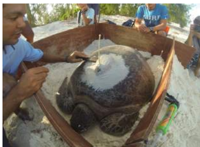
The research team affixing the satellite tag to 'Alda'

To identify suitable candidates for the tags, intensive monitoring using the atoll-wide flipper tagging programme was conducted to find turtles that were towards the end of their breeding season. This reduces the chance of the tag being knocked off during mating and ensures that the female would be leaving Aldabra waters soon. Both of the turtles fitted with satellite tags this month had been present on Aldabra since early March. 'Alda' had been observed nesting on at least three occasions prior to the tag being fitted. Encouragingly both of the turtles are seasoned nesters on Aldabra, as 'Alda' nested on Picard in 2007 and the other female in 2005.