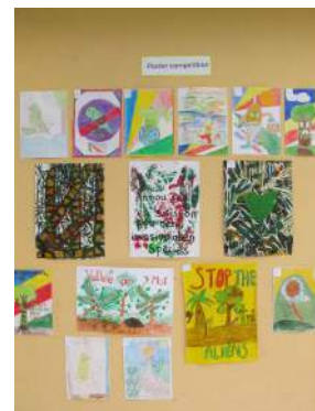
Entries in the poster competition on invasive species

showing a good understanding of the threat of invasive species in Seychelles amongst the schoolchildren.