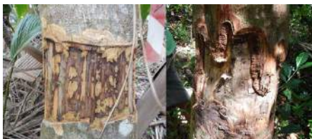
Ring-barked trees with bark regrowth 9 months after ring-barking

Thankfully the numbers of these trees are low in the Vallée de Mai. The Big Tree Survey carried out in early 2014 identified 84 jackfruit, 61 santol and 33 bwa zonn adult trees in the Vallée de Mai. Such relatively small numbers make their management easier. All individuals of these target species have been ring-barked by the team and trees near the paths are covered with natural material to avoid a visual impact and respect the natural harmony of the landscape within the forest. The ring-barking method used is based on valuable advice from experienced local foresters which ensures that the ring-barking removes part of the circulatory system of the tree, causing a gradual drought and eventually killing the tree. Effective ring-barking also limits potential 'healing' mechanisms such as the regrowth of bark or aerial root systems.