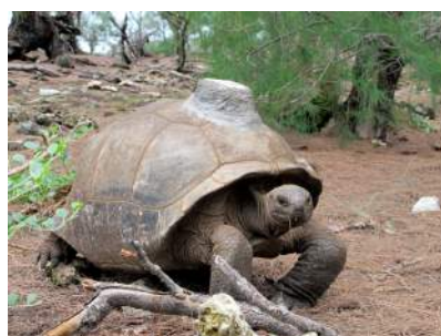
Giant Tortoise with transmitter attached

Over the past few months researchers from the Zurich-Aldabra Research Platform (ZARP) collaboration have been involved in several different areas of research on Aldabra. After five tortoise enclosures were completed on East Grande Terre researchers focused on investigating