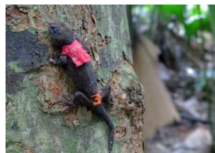
Released Giant Bronze Gecko number 3 with radio-transmitter backpack