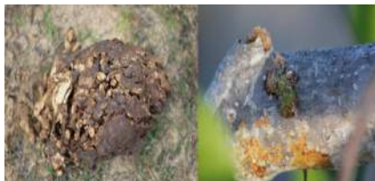
Faecal analysis samples from Giant Tortoise (left) and Blue Pigeon (right)

may limit the mys reproduction. The most exciting result though is that the data suggest that Aldabra Giant Tortoises are a major driving force of the seed dispersal network on the atoll. They consume fruits from a wide variety of plants, and many seeds seem to pass undamaged through their guts. Feeding trials performed with Giant Tortoises on Aldabra indicate that it takes a minimum of 8 days for the seeds to pass through their guts, which means that they may disperse seeds over great distances.