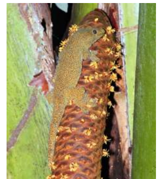
The Giant Bronze Gecko ( Ailuronyx trachygaster) or 'Trachy' in its usual hangout on a Coco de Mer catkin