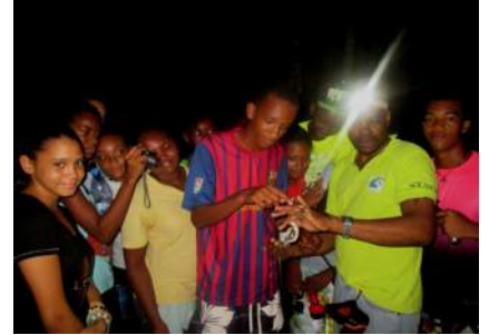
Students find a snake on their night safari in the Vallée de Mai

Participants of the Seychelles Duke of Edinburgh award scheme recently came to the Vallée de Mai for a night safari. The visit is part of activities conducted under the Duke of Edinburgh award scheme that enables young people to learn practical skills that are valuable to their personal and professional development.