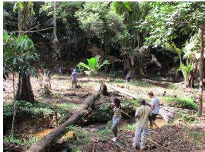
Participants working at the plot site

On the 24 th May a new community stewardship scheme on Praslin to promote the protection of native palm forest was launched by SIF at the Vallée de Mai. The launch of the scheme coincided with celebrations for the International Day of Biodiversity, whose theme 'Island Biodiversity' was very fitting for the start of this scheme.