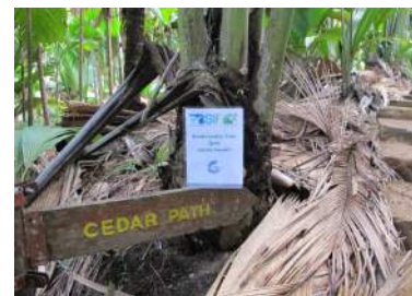
Beginning of the Biodiversity trail quiz in the forest

The theme for this year's International Day of Biodiversity was 'Island Biodiversity' and it is was chosen to coincide with the designation by the United Nations General Assembly of 2014 as the year of Small Island Developing States. With this in mind SIF chose to focus their celebrations on the threat that invasive species pose to the unique biodiversity of the islands of Seychelles. Several different activities were organised at the Vallée de Mai, including the launch of the community stewardship scheme (see article in this newsletter). Whilst the adults were working on the stewardship scheme plot, back at the education centre their children were learning about the impacts of invasive species on the environment by participating in different games such as 'Invasive species bingo' and 'Invasive or Native?'.