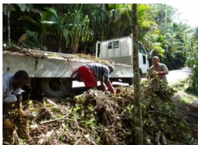
Piles of invasive plants removed from the plot

The plot is naturally split into three sections by a small river. One of the sections is waterlogged for most of the year providing perfect conditions for endemic plants such as Vakwa Parasol which thrives in this environment. The seedlings were planted around 1m apart to give them enough space as they grow. The species planted included Bois de Natte ( Heritiera littoralis ), Lattanyen Lat ( Verschaffeltia splendida ), Lattanyen Fey ( Phoenicophorium borsigianum ), Lattanyen Milpat ( Nephrosperma vanhoutteanum ), Lattanyen Oban ( Roscheria melanochaetes ), Palmis ( Deckenia nobilis ), and Vakwa parasol ( Pandanus homei ). Alongside the planting, some members of the team worked in the site removing invasive species such as Vya Tang and Philodendron, while others controlled larger invasive alien trees such as Lagati with ring-barking.