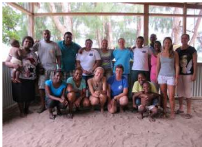
The SIF team at the workshop on Curieuse Island

A two day workshop was held on Curieuse Island this month for members of the Vallée de Mai and Head Office management team to discuss the forthcoming review of the Vallée de Mai management plan.