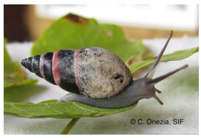
The Aldabra banded snail (Rachistia aldabrae) is distinctive, with a dark purple shell encircled by pink rings. Photo by Catherina Onezia, SIF.

The snail was named after the Aldabra atoll, a UNESCO World Heritage Site that is part of the island nation of Seychelles, the capital of which lies 1,500 kilometers (932 miles) off the coast of Southeast Africa. It was declared extinct in a paper published in Biology Letters in 1997 after extensive searches turned up no evidence of the species' existence. But on Aug. 23, a staff member with Seychelles Islands Foundation (SIF) – the organization tasked with management and protection of Aldabra – chanced upon a peculiar snail on a native tree on the island Malabar.