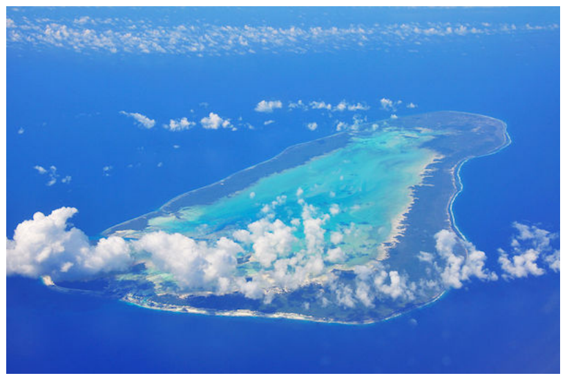
Aldabra atoll forms the largest lagoon in the Indian Ocean. The snail was rediscovered on Malabar, its secondlargest island.

adults, but the small juveniles would be less able to tolerate the desiccation. Consequently, long dry periods would be expected to reduce reproductive success, with complete failure in prolonged dry periods."